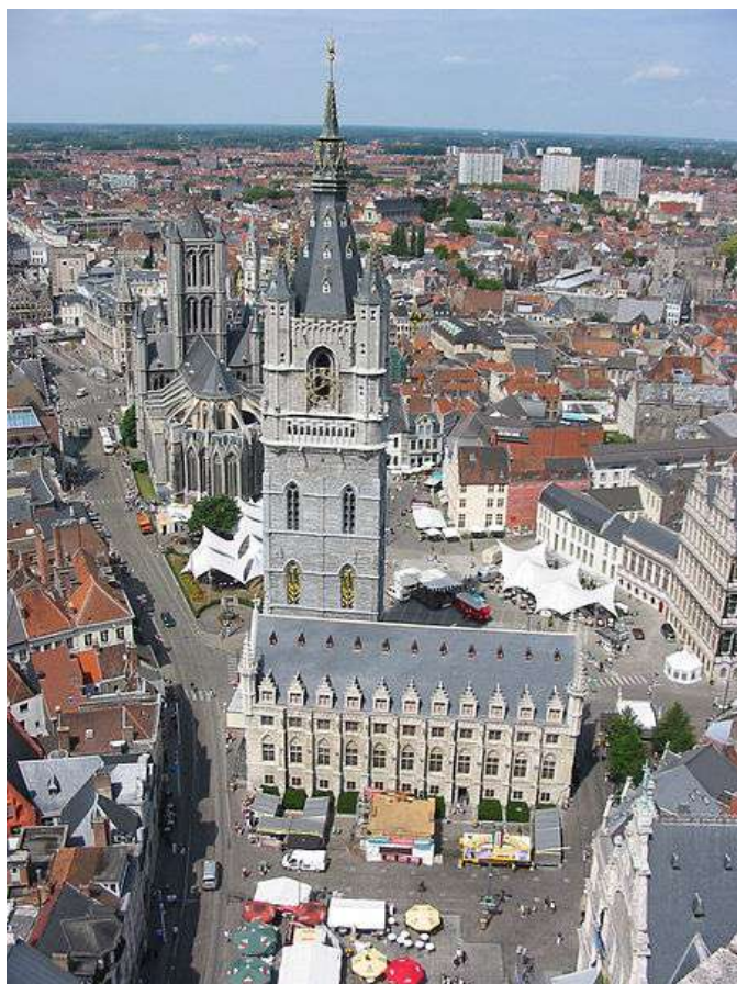
Belfort Gent, the Belfry of Ghent